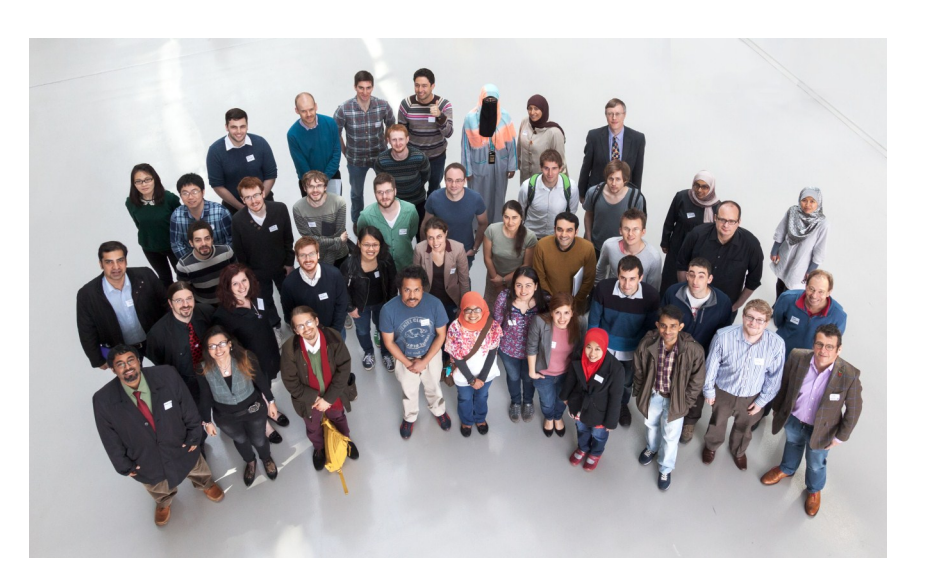
Group photograph of the participants at the Annual Manchester SIAM Student Chapter Conference 2014